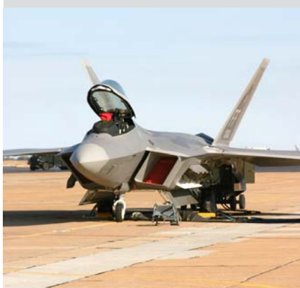
A 27th FS Raptor being readied for flight. (Andrew McLaughlin)

"The biggest challenge in flying the Raptor is information management," LtCol Tolliver continued. "All the data is at your disposal – you just need to know when to access the information and how to use it. For conversion, because there's no two-seater, you do eight-to-nine simulator flights before your first flight. And before you do your first flight, we suit you up and take you out to the jet and do all your ground checks in a dummy run as if you were going to fly. Your first flight won't just be a jaunt around the airfield; it's a full mission where you explore the AHC (advanced handling characteristics), and then perform four-to-five practice landings when you return to base.