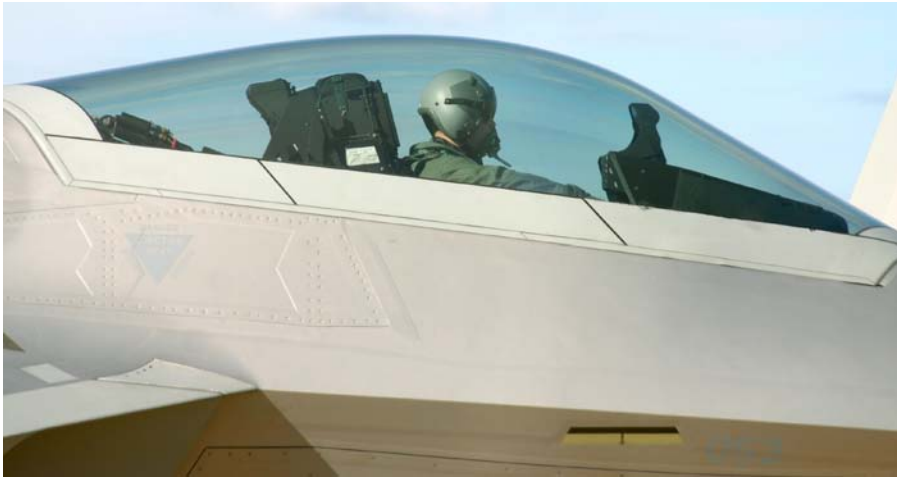
"It's pretty much leaps and bounds ahead of any fighter out there. It brings situational awareness through its sensor suite, tasking and fusing far greater than any other fighter."