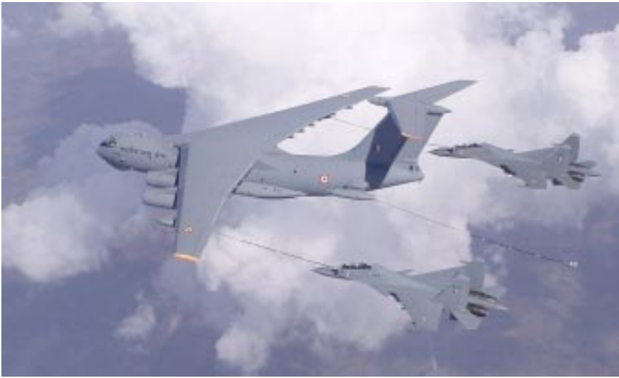
The regional strategic environment is shifting, with the first Ilyushin Il-78M1 Midas tankers delivered to the Indian Air Force. India has been the 'trend setter' for Asian buys of Russian equipment, and we can expect a series of copycat regional buys over the coming decade, as observed with Su-30s and AEW&C aircraft.

livery of its first batch of Ilyushin Il-78M1 Midas tankers from Russia. Historically China has followed India by acquiring like Russian aircraft to match capabilities, and the saga of regional 'me too' Sukhoi and A-50 AEW&C buys indicates that more Ilyushins are likely to appear across the region over the coming decade. The only constraint to regional growth in fighter, AEW&C and tanker numbers will be funding.