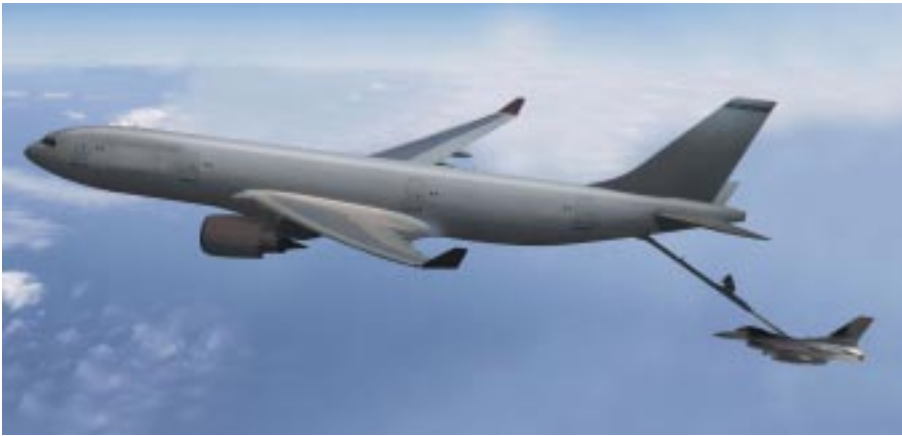
The A330 MRTT (above) and KC-767A (below) are conversions of the current late production variants of the A330 and 767 commercial airliners. With a range of configurations possible, including booms, fuselage hose drum units, and wing mounted pods, these aircraft are direct equivalents to the established KC-135R/T Stratotankers. While slower than the KC-135R, the newer widebodies are much more capable in the supplementary airlift role, and cheaper to operate with only two engines. While the Boeing offering has the advantage of a much more mature aerial refuelling package design, the Airbus offering can offload slightly more fuel, runways permitting.