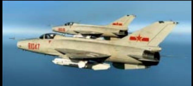
The J-7E and G variants use new avionics and a new double delta wing.