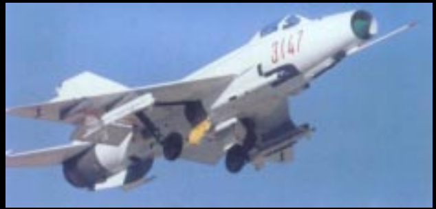
The J-7-II is equivalent to later Russian MiG-21s.

The initial batch of Su-30MKs has been put at 38 to 50 aircraft for the PLA-AF, with the PLA-N now opting for the 'maritime' Su-30MK2 with avionics changes for the role. Available photographs and press reports indicate that the Kh-59 Kazoo has been acquired, in electro optic/datalink guided and radar guided anti-ship variants, as well as the Kh-31R anti-radiation missile and the Kh-31A anti-shipping missile – the Kh-31 is likely to be licence built now. The KAB-1500 and KAB-500 guided bombs have also been supplied.