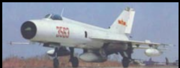
The J-8R is a tactical reconce variant of the early J-8-I, with podded sensors.