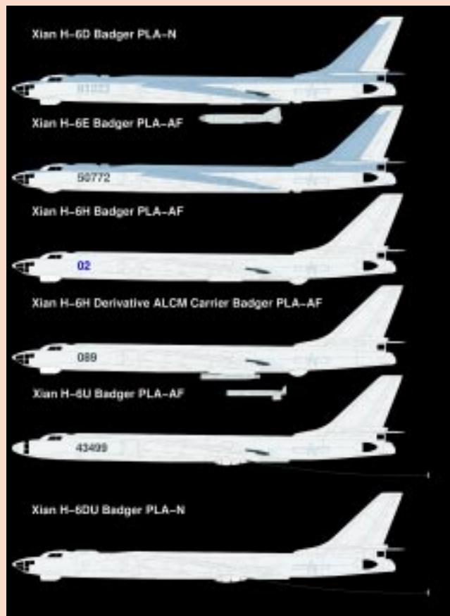
The venerable H-6 Badger remains a key element in the PLA force structure, with a range of early and much newer variants in service. The latest H-6H series are cruise missile carriers, with electronic warfare equipment replacing guns. An as yet unnamed H-6H variant has been flown with four wing pylons loaded with what appear to be Russian Kh-55/65 cruise missiles. The Xian website continues to list the Badger in its current production lineup.

Australia cannot afford to ignore the long term strategic reality.