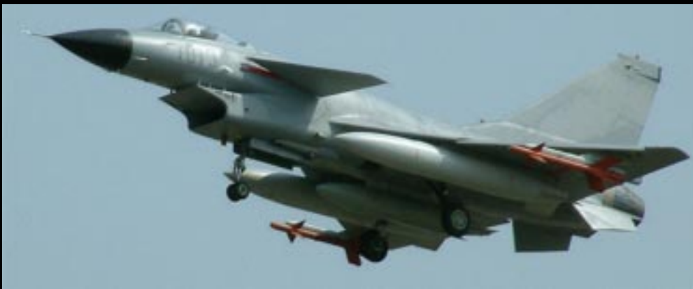
The Chengdu J-10 is clearly not a Lavi, but will be competitive against the Eurocanards in capabilities. It is the 'Lo' component of a 'Hi-Lo' mix with the Su-27/30.

Russia's industry is also heavily involved in the development of China's SD-10/PL-12 'Project 129' active radar homing beyond visual range missile. Similar in appear-