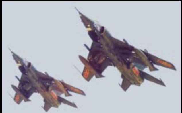
The Q-5/A-5 series are a significant evolution of the F-6/MiG-19 family, filling the A-4 Skyhawk niche.