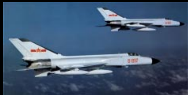
The large twin engine Finback is used mostly as an interceptor, this is a unique design derived from MiG-21 technology but twice the size.