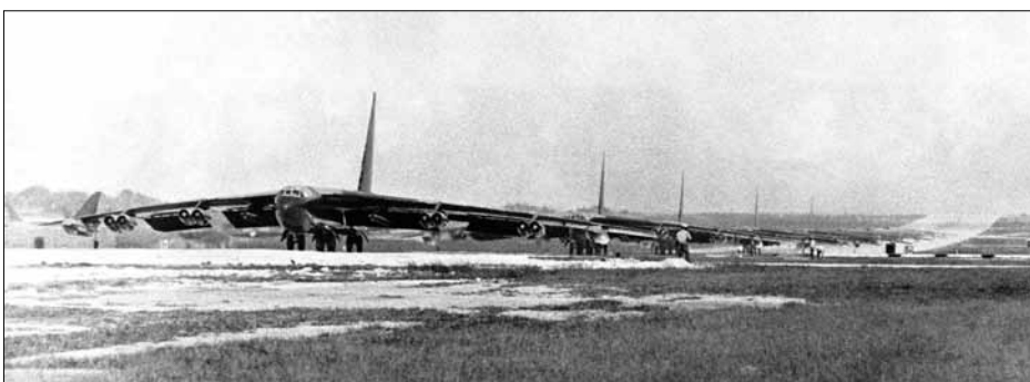
B-52 Stratofortress heavy bombers queuing up for takeoff at Andersen AFB, Guam, during Operation Linebacker II in 1972.