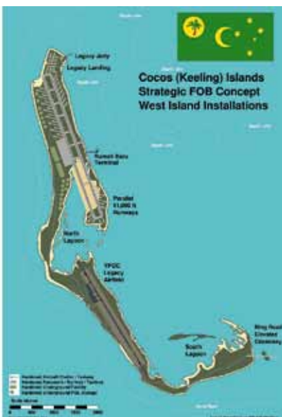
Concept diagram for Cocos Islands redevelopment. This and similar basing arrangements are viable for high tempo combat operations, while providing peacetime eco-tourism potential. Environmental impact is minimised by siting the airfield on the unused coconut plantation, and placing the wharf outside the central lagoon (Author).