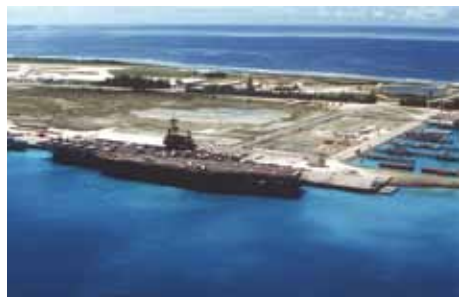
USS Saratoga berthed at Diego Garcia.