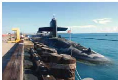
SSGN USS Florida berthed at Diego Garcia.

These considerations apply to Australian strategic needs in the context of defending Australia's immediate interests in the region, during a period of increased strategic competition across the region. They take on an additional dimension, if we consider the strategic needs of our principal ally, the United States.