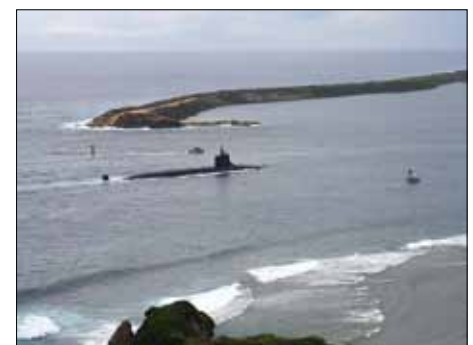
A US Navy SSN entering Apra Harbor, Guam.