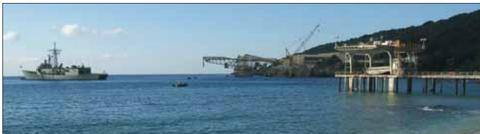
Flying Fish Cove at Christmas Island, with a visiting RAN FFG-7.

Christmas Island, given its "Guam-like" geology, presents few technical problems in development as a major airbase location. The abundance of dense and tough volcanic rock on the island permits the construction of a well hardened or superhardened airbase facility with no difficulty.