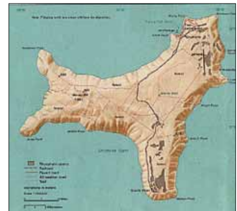
Central Intelligence Agency map of Christmas Island.