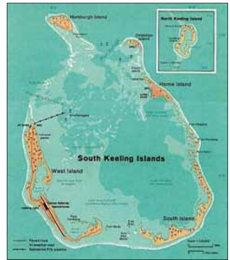
Central Intelligence Agency map of the Cocos (Keeling) Islands.

“ ... the safest strategy for Australia is to properly develop the military potential of the Cocos Islands, as a naval replenishment site, and an air force 'Strategic FOB' along the lines of the British SEAC effort in 1944 - 1945. It would demonstrate that Australia has the intent to defend its interests and sovereign territories in the Indian Ocean. ”