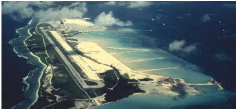
Diego Garcia in the BIOT, the airfield and wharf is shown under construction.