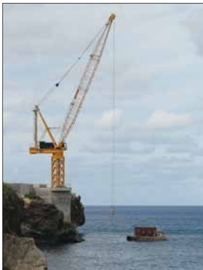
Norris Point container facility at Christmas Island.