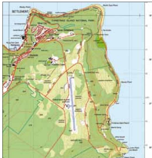
Redevelopment of the existing YPKM airport site into a dual 11,000 ft PCN100 runway system for civil and military use does not present unusual challenges given local terrain.

The existing airfield site could be readily expanded in the northern direction into a parallel 11,000 ft x 200 ft runway arrangement, without any significant environmental damage. The result would be similar to Andersen AFB on Guam.