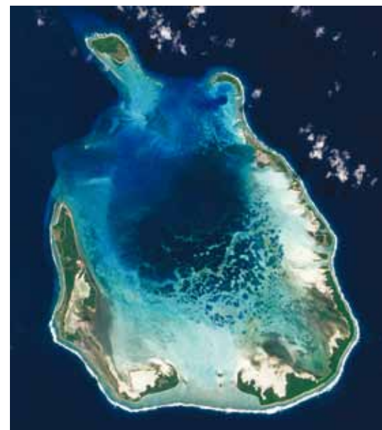
Image of the Cocos Islands taken in 2009. The best anchorage is off Direction Island at the NE rim of the atoll, with excellent deep water access for large logistical vessels. The central lagoon is too shallow for military use, and environmentally fragile.

Cocos (Keeling) Islands is recommended, to support P-8 Poseidon maritime aircraft, thus exploiting only a small fraction of the actual strategic potential of either location. Discovered in 1609, the Cocos Islands were initially a privately owned asset, granted to the Clunies-Ross family in perpetuity by Britain in 1886, with jurisdiction transferred to Australia in 1955, and the Clunies-Ross family losing control of the islands by the late 1970s. The economy, since initial colonisation, has been based on palm tree plantations, but more recently eco-tourism, especially for divers. The Cocos Islands are geologically a horseshoe shaped coral atoll situated on top of a submerged seamount, itself part of a submerged mountain