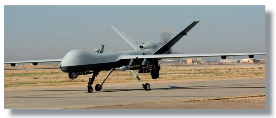
Remotely Piloted Vehicles such as this MQ-9 Reaper have proven to be highly valuable ISR platforms in COIN operations, but are unusuable against nation state opponents armed with modern battlefield SAMs and fighters.

At the most fundamental level, physics and mathematics dictate what can be achieved using basic technology, and basic technology at any