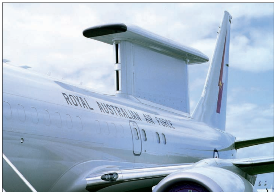
Antennas, whether used for radar or communications, neither shrink nor improve in performance exponentially, as they are limited in performance growth by radio physics and the cooling capability of the carrying platform.