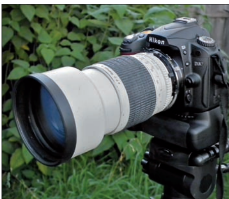
Optical imaging chips may well be growing in resolution exponentially, but the optical apertures used, such as lenses, do not. While the professional lens on this digital camera outperforms the 12.3 Megapixel camera body, it would be inadequate in sharpness for a future 120 Megapixel camera body.

The pervasive nature of modern digital technology has produced some genuine and deep problems at the human end of the equation, mostly as byproducts of a prior failure to properly educate, train and staff organisations, itself a result of a failure to understand or anticipate the impact of exponential growth laws. Clearly most of these problems can be corrected by properly staffing organisations with personnel who are trained to think critically and understand the limitations of exponentially growing technologies. The biggest challenge is not however in the implementation of corrective action, but in gaining acceptance that action is even required!