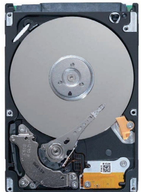
This state of the art Seagate Momentus XT hybrid hard disk drive is an interesting example of Kryder's exponential growth law in its 500 Gigabyte magnetic disk technology, Moore's exponential growth law in its 4 Gigabyte DRAM cache, and mechanically limited head technology with a 4 millisecond access time, not significantly better than a 3.5 inch drive of a decade ago.

The increasing dependency of developed nations upon pervasive digital technology creates in itself a single point of failure vulnerability, as traditional human processing and handling of information and data is abandoned, and skills to do so lost and no longer taught. Whether damage is inflicted by human driven effects such as cyber warfare or electro-magnetic weapons or by 'Mother Nature' solar flares, the material reality is that exponential growth is creating in turn a growing vulnerability to the loss of the IT/ICT infrastructure, regardless of the cause of the loss.