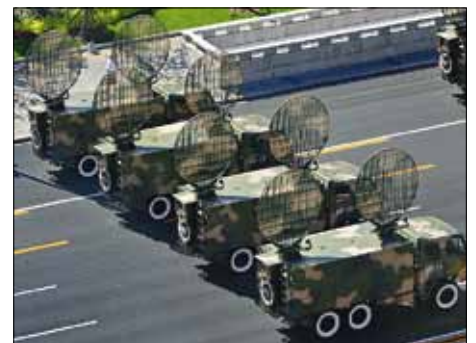
TS-504 troposcatter system.

small numbers of such weapons, saturation attacks change the whole strategic dynamic. Compared to ASCM attacks, ASBM attacks offer more warning time as the ASBM can be tracked during the exo-atmospheric phase, and later the ionization trail of the MARV is readily detected by radar. On the other hand, ASBMs are significantly faster making them more challenging targets to intercept. While ASCMs can still be engaged by close-in gun systems or lasers once inside the minimal engagement distance of defensive missiles, ASBMs are much too difficult a target for such terminal defences – their speed alone requires exceptionally high tracking rate performance for an effective intercept. The US Navy does not operate any specialised endo-atmospheric ABM as the second layer defence to stop ASBMs that have escaped interception by the SM-3. Existing ABMs in the required performance class, such as the Russian 9M82/SA-12B Giant and 9M82M/SA-23B, the US THAAD, or Israeli Arrow II, are large two stage missiles. The DF-21D ASBM is a major advance for the PLA, and will be very expensive to counter reliably. It is but one of many capabilities China is deploying to make the Western Pacific unsafe for Western naval surface fleets.