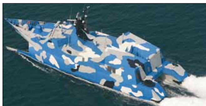
Type 22 fast catamaran missile boat.