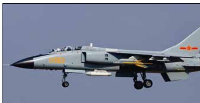
A JH-7A Flounder armed the KD-88 ASCM.