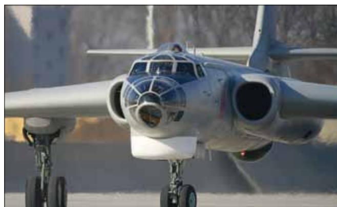
A H-6M Badger armed with two KD-63 ASCMs.