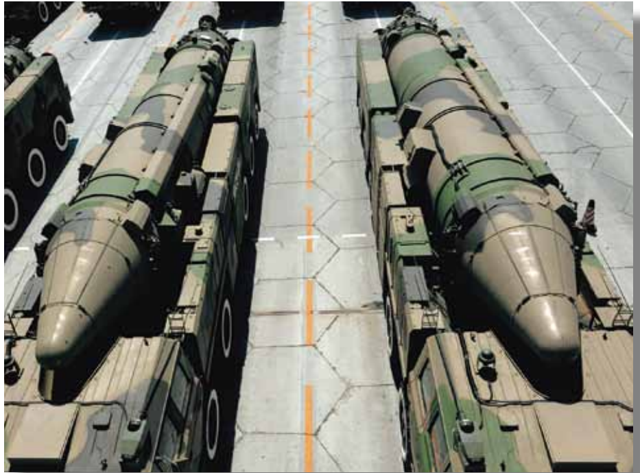
No images have been released showing the DF-21C MARV or DF-21D ASBM MARV.

‘ While ASCMs can still be engaged by close-in gun systems or lasers once inside the minimal engagement distance of defensive missiles, ASBMs are much too difficult a target for such terminal defences – their speed alone requires exceptionally high tracking rate performance for an effective intercept. ’