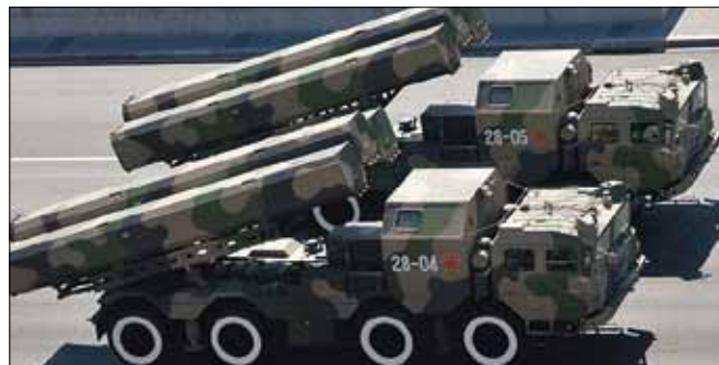
CJ-10 GLCM TEL.