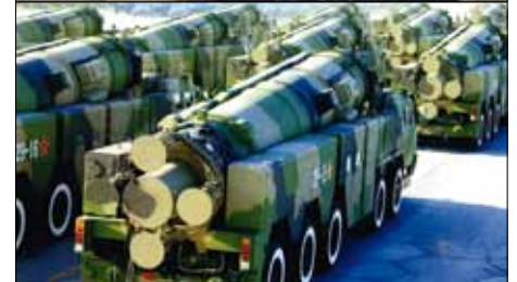
DF-21C WS-2400 TEL.