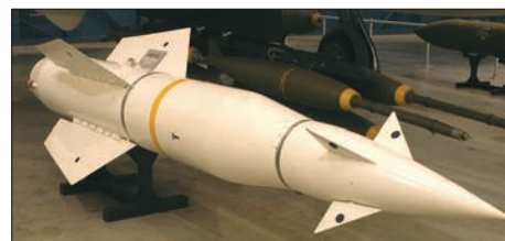
The Maxson AGM-12C Bullpup command link guided missile was used with limited success during Rolling Thunder.

While SAMs and radar directed large caliber AAA could be impaired by radio frequency jamming, visually aimed guns at low altitudes were a