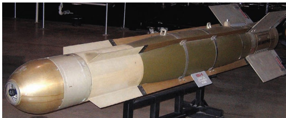
The Rockwell GBU-8/B 2,000 lb and GBU-9/B 3,000 lb HOBOS television guided bombs were used in the latter phase of the Vietnam war (Wikipedia).

The world had changed by the mid 1960s. The PAVN (People's Army of Viet Nam) was supported by large numbers of often highly skilled Warsaw Pact and Soviet instructors, and lavishly supplied with anti-aircraft weapons by the Soviets and Chinese. The result was an air defence system across the north of Vietnam equipped with a density of Anti-Aircraft Artillery (AAA) pieces of all calibres which rivalled or exceeded the historical benchmark of Luftwaffe and Wehrmacht AAA defences during the 1944-1945 period. No differently, PAVN defences made extensive use of Soviet supplied SON-9/30/50 Fire Can / Fire Wheel / Flap Wheel gunlaying radars, and from 1964 onward deployed the S-75/SA-75 / SA-2 Guideline Surface to Air Missile (SAM) system. US aircraft had to deal with SAMs at high to medium altitudes, 57 mm, 100 mm and 130 mm AAA at medium altitudes, and barrages of 7.62 mm, 12.7