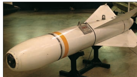
The 1,000 lb class AGM-62 Walleye I television guided bomb was the first "smart bomb" used in the Vietnam conflict.