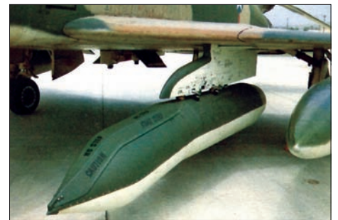
The Ford AVQ-10 Paveway laser targeting pod overcame the limitations of the earlier AVQ-9 Paveway Light cockpit designators and was the preferred system in 1972.

The 8th TFW deployed the first laser guided bombs in mid-1968. The weapon proved spectacularly accurate, with claims that half of the bombs dropped scored direct hits, and the overall Circular Error Probable (CEP) claimed at 8 ft (likely overstated). Because the bomb kit was much cheaper and simpler than the TV guided weapons, it could be bought in larger numbers. It is fair to observe that the Paveway was the first genuinely successful and affordable guided bomb.