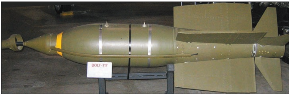
The Texas Instruments GBU-1/B "BOLT117" 750 lb laser guided bomb was the first such weapon to be used in combat, and proved highly successful (Wikipedia).

more difficult problem. It was soon realized that increasing bombing accuracy from higher altitudes at higher speeds would be the most effective measure to overcome losses to barrage AAA.