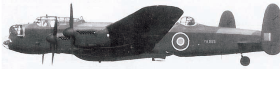
An Avro Lancaster modified to carry the 12,000 lb Tallboy bunker buster bomb. top: A recently constructed Canadian replica of the Tallboy.

Air Chief Marshal Sir Wilfred Freeman approached Wallis and asked how soon the 1940 bomb concept could be developed and put into production. Wallis is reported to have asked for four or five months. There were many challenges to be overcome. Delivery of these bombs required a modified Avro Lancaster, capable of safely lifting these enormous weapons. A more accurate bombsight was required, with aircrew training to match. Only two foundries in Britain could manufacture the unique steel castings Wallis needed for the bomb casing, which required unique heat treatment. Very few manufacturers could precision-machine the bomb casings, this taking up to a month per bomb. New fuse designs were required along with new dollies and trailers to move the bombs. New machinery was required to pour the RDX explosive filler into the casings.