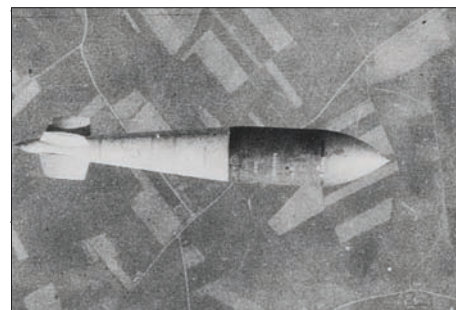
A Tallboy after release from a 617 SQN Lancaster.

The first two prototype Tallboys were tested at Ashley Walk test range. The first drop saw the weapon accelerate to a supersonic terminal velocity and then almost topple due to compressibility effects, wholly compromising accuracy. Wallis pragmatically altered the tail-kit design, canting the tail surfaces to impart rotation as the bomb descended. The gyroscopic effect would then overcome unwanted aerodynamic forces.