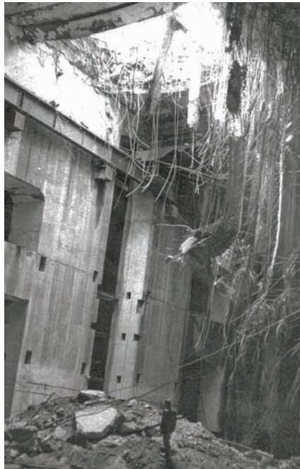
The massive Farge U-boat pen did not survive Wallis' bombs.

The USAF was impressed with the Tallboy and Grand Slam and licensed the weapons as the M109 or T-10 and M110 or T-14. US Tallboys and Grand Slams used mostly rolled plate casings with forged nose cones. Boeing B-29 Superfortresses were modified to carry both, either a single centreline