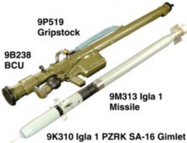
Russia remains a significant manufacturer of MANPADS. The 9M32 series was supplanted by the improved 9M34 Strela 3 or SA-14 Gremlin, in turn replaced by the largely redesigned 9K38 Igla or SA-18 Grouse and 9K310 Igla 1 or SA-16 Gimlet. The Igla series of missiles is credited with a cooled two colour seeker making it a technological equivalent to the FIM-92B/C series and highly resistant to flares. The distinctively shaped BCU makes these weapons easy to identify. (Author/Rosoboronexport).

not unlike the Concorde crash, or other situations where catastrophic fires or structural damage occurred. However, other combinations of circumstances could see the aircraft damaged but capable of limping on and making an emergency landing.