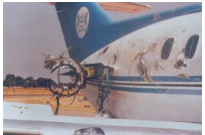
This BAe 125 corporate jet lost its starboard engine to an SA-7 whilst over Southern Africa. Incidentally, the crew thought the engine had simply failed and flamed out as their engine instruments went dead. It wasn't until they landed that they realised what had happened. The object of the attack was to destroy the aircraft and its African Head of State passenger. Note the extensive pattern of missile and engine fragment damage on the fuselage and flaps. Primary and secondary damage effects to structure, fuel, flight control and hydraulic systems can be more lethal than the loss of an engine as evidenced by numerous catastrophic engine loss case studies.

Whether an aircraft is to drop flares or use a jammer, knowledge of an attack in progress is vital. Missile Approach Warning Systems remain an area of controversy. Three technologies are used – active Doppler radar, passive infrared and passive ultraviolet. For military applications the Doppler radar approach is often rejected as it is