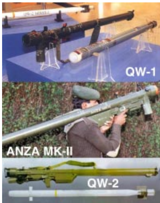
China has become a major player in the MANPADS export market. The HN-5B MANPADS was supplanted in production by the QW-1 with a cooled Indium Antimonide all aspect midwave infrared seeker. The more recent QW-2 incorporates incremental improvements and is being marketed as an equivalent to the Iгла, FIM-92B Stinger and Mistral series. The QW-1 series are easily recognised by the cylindrical BU/BCU module mounted at a right angle to the missile tube. Pakistan is a major export client for the PRC and has licence built the HN-5B as the ANZA MK-I and the QW-1 as the ANZA MK-II.

In best case scenarios the operator may fire the missile at the limits of viable geometry and it will fall out of the sky before it hits. If it hits with low kinetic energy it may not do much damage. If the missile is time expired the warhead may lose effectiveness or the fuse may fail. However, reliance on