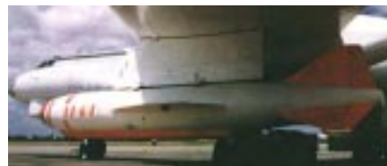
C-601 (above) and (below) C-801K (PLA)