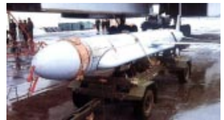
(below) India has licenced the supersonic ramjet Kh-61 Yakhont as the Brahmos. (NIC)