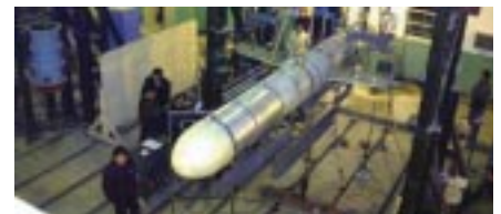
A rare image of a prototype Chinese strategic land attack cruise missile (above), bearing a remarkable resemblance to the Tomahawk. Many reports claim China acquired a pair of failed Tomahawks from al-Qaeda after the 1998 US strike. Recent reports also claim China acquired tooling and engineering data for the Russian Kh-65SE ALCM, depicted (below) the longer ranging Kh-55M variant of this missile.