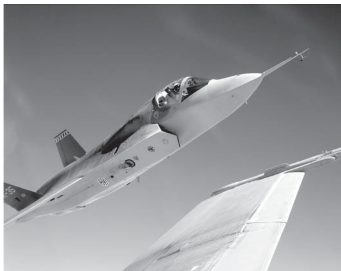
On a wing and a prayer? History suggests there are significant risks ahead for JSF development.

The decision to buy into the JSF program and provisionally commit to this aircraft as the primary solution for AIR