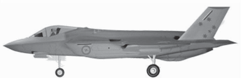
Lockheed-Martin F-35 Joint Strike Fighter USAF Variant