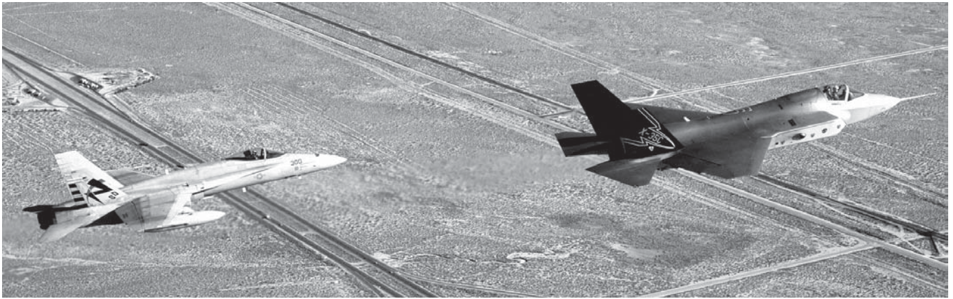
An X-35 demonstrator flies in company with an F/A-18. While the F-35 is roughly the size of an F/A-18A/C, its empty weight is closer to an F-15A/C, with an internal fuel capacity greater than an F-15A or F/A-18E. (Lockheed Martin)

the 767-200 tanker suggests that a one-for-one replacement of the F-111's existing unrefuelled capability (25 x F-111 to cca 950nm [1760km] with four external 2000lb bombs) using 50 JSFs (each with two internal 2000lb bombs) yields a requirement for around four supporting tankers, three for force refuelling and one airborne spare.