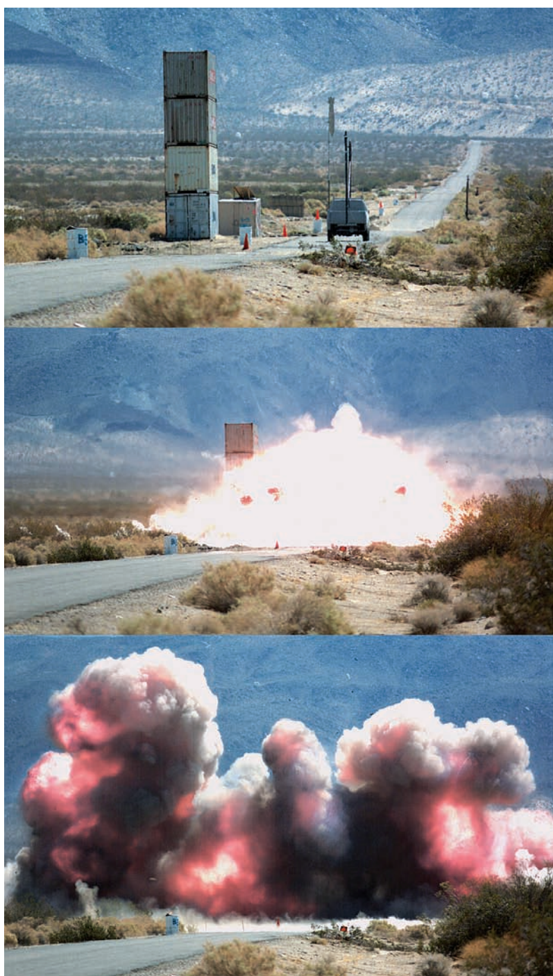
GBU-54 Laser JDAM trial drop at USNWC.

CAS has been an integral part of such manoeuvre operations since the early 1940s, with this model continuing to be used, most recently during the 2003 invasion of Saddam's Iraq. CAS in COUNTER INsurgency (COIN) operations follows a similar pattern, but usually involving lightly armed insurgents and in recent times, human shielding by exploiting civilian presence especially in urban areas.