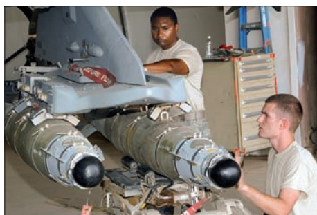
GBU-54/B laser JDAM.