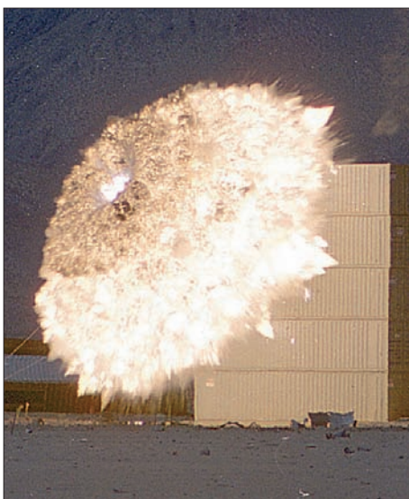
GBU-32 JDAM exploding on impact at USNWC.

is that he has a better 'bird's eye' view of the engagement, but often airborne FACs suffer heavy combat losses, as flying low and slow to 'eyeball' the engagement results in exposure to small arms, machine guns, automatic cannon fire, and since the late 1960s, MANPADS fire.