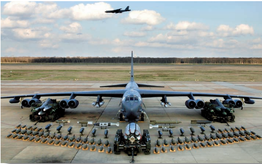
B-52H "Buff" armed with JDAM.