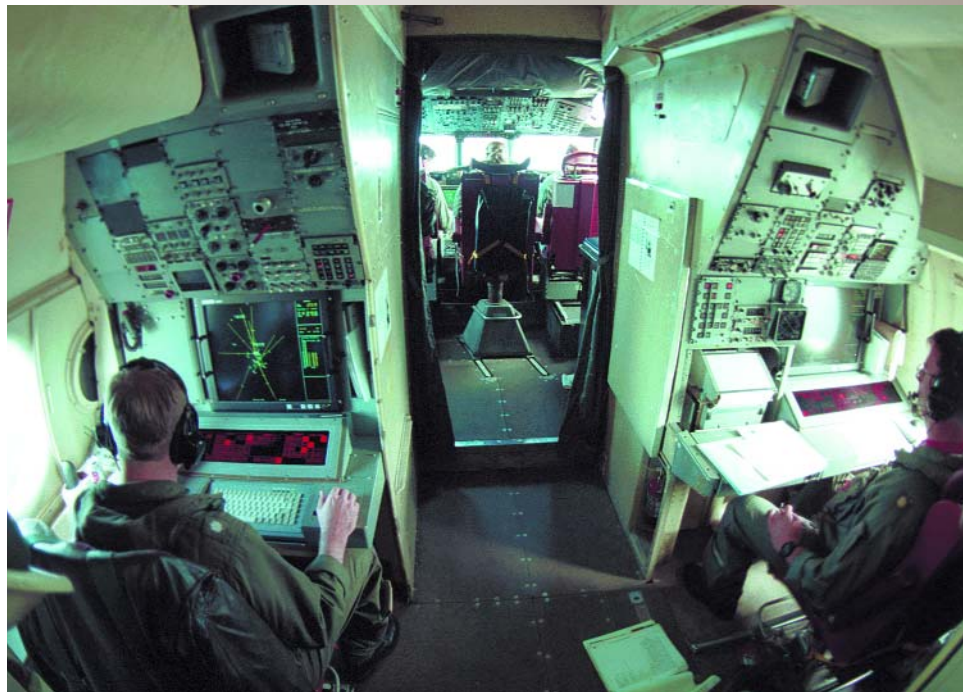
On board a US Navy P3-C Orion.

In practice such a force would shift a significant proportion of its total hours across to the UAV component, reducing fatigue life consumption, personnel and