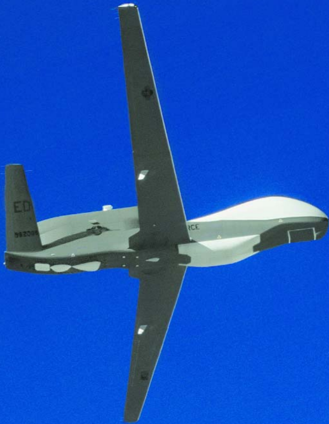
We have yet to see the full impact of HALE UAVs such as the RQ-4 Global Hawk on the maritime patrol roles and missions environment. With superior footprint coverage and persistence, UAVs offer some attractive capabilities absent in 'classical' manned patrol aircraft.

slow and clumsy Catalinas soon supplanted by the PB4Y-1, a rebadged B-24D/J, and later its offspring the single tail PB4Y-2 Privateer.