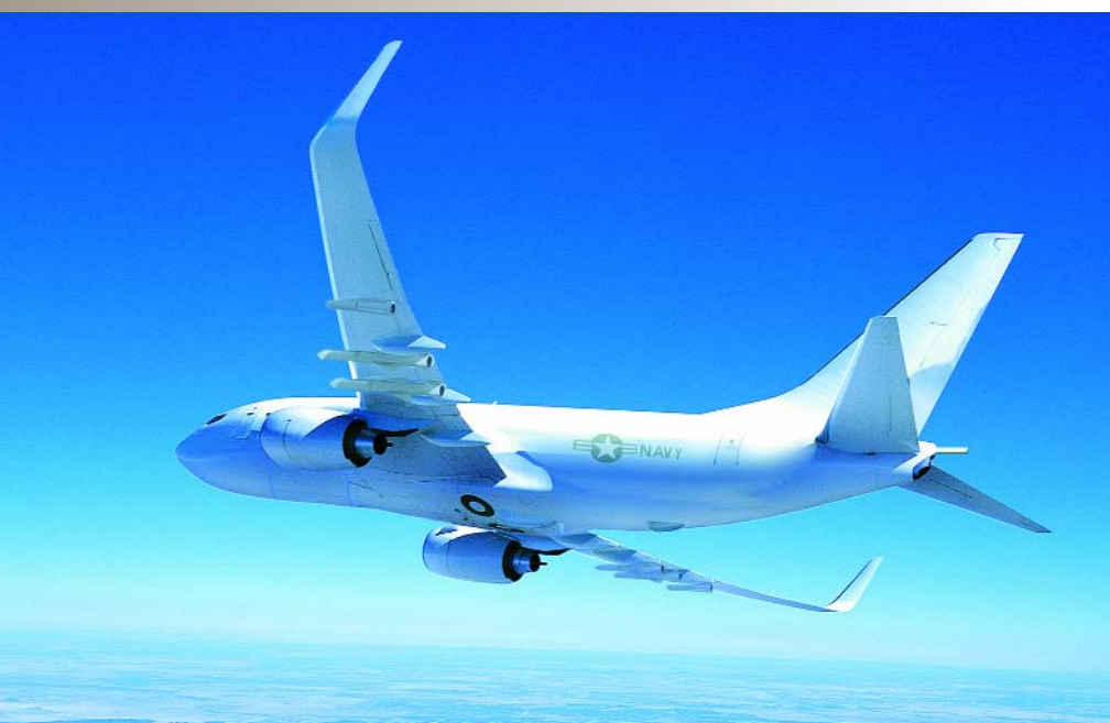
Boeing's MMA proposal is based on the 737-800 airframe, with a heavier -900 series wing. The fuselage is extensively modified to accommodate a sonobuoy bay and internal weapon bay. Pylons are used for the external carriage of weapons such as the Harpoon missile.

The world of Long Range Maritime Patrol is undergoing the biggest technological and operational changes seen since its inception during the 1940s. These changes are a reflection of evolving roles and missions, and growth in a range of new technologies, especially long endurance UAVs and ISR sensors. Over the next two decades we can expect to see the evolution of a quite different paradigm to that we have known for six decades.