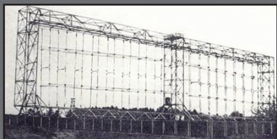
Knickebein transmitter ground station. Many were built along the coast of occupied Europe.

bombers with Lorenz receivers. If the aircraft was aligned with the boresight of the beam the pilot would hear a steady tone in his headset, if he was left or right of the centre of the beam, he would hear either dots or dashes. The Lorenz system was a tremendous innovation for the period and ultimately led to modern Instrument Landing Systems (ILS).