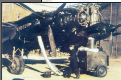
Pathfinder He-111H bombers of the elite KampfGruppe 100 wing were the first to deploy the Y-Geraet radio navigation aid to mark targets for other Luftwaffe bombers.