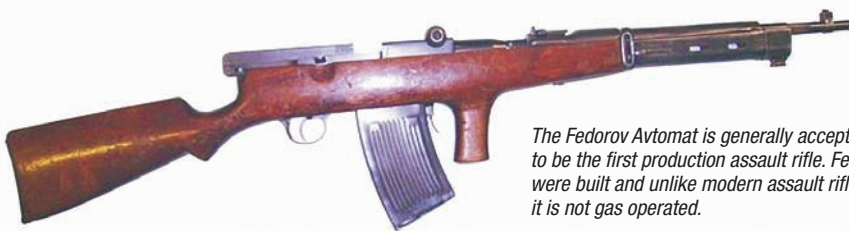
The Fedorov Avtomat is generally accepted to be the first production assault rifle. Few were built and unlike modern assault rifles it is not gas operated.

The first weapon to meet the basic definition of an assault rifle, in using a cartridge size intermediate between a pistol and rifle and gas operated mechanism, was the Italian Cei-Rigotti designed in 1890 and redesigned in 1900. The weapon fired a 6.5 mm round from a 25 round magazine.