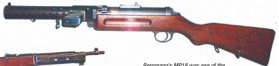
Bergmann's MP18 was one of the first mass production submachine guns, firing 9 mm pistol rounds. A key contributor in the design was Hugo Schmeisser who later designed the MP43.

A modern definition of an assault rifle is that of a weapon with a fully automatic, often burst automatic and semi-automatic firing modes, uses a cartridge size and propellant load intermediate between rifles and pistols, a large magazine containing multiple rounds, a barrel length under 0.5 metres, and a gas operated firing mechanism. The pressures of combat during this period saw two classes of automatic infantry weapon emerge, these being submachine guns and assault rifles.