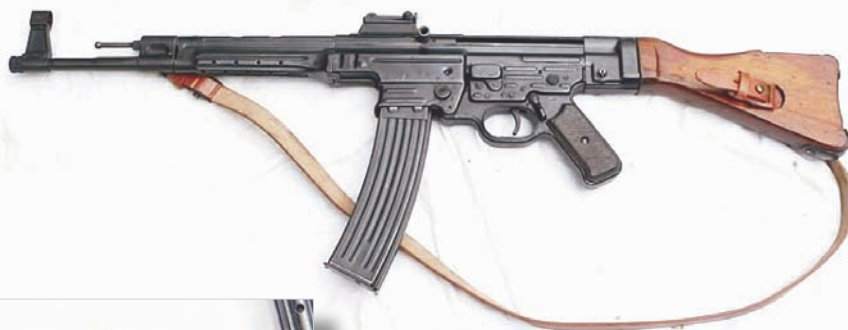
SturmGewehr StG44, the first mass production assault rifle. Elite Waffen SS divisions used it extensively on the Eastern Front.

What is clear is that Hugo Schmeisser's work in 1942 produced an impact well beyond his wildest expectations.