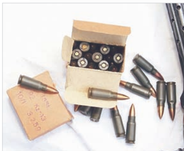
MP43 magazine and 'Kurzpatrone' ammo.