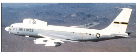
The US Air Force Airborne Laser Lab was a key milestone, proving the viability of laser DEWs in an airborne environment.

on their website. It was to be carried by the 8 x 8 MAZ-7910 'Kashalot', better known as a 'Scud launch vehicle'. It is interesting to observe that one of the recent rounds of public relations promotion by US defence contractors, extolling the virtues of US laser DEWs, produced an angry outburst by a former Soviet researcher in the Russian press, who complained that the Soviet effort achieved much the same results 20 years ago.