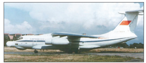
The Soviets paralleled the US ALL program with the Beriev/Almaz A-60 program. Little has been disclosed to date on achievement.

double up as 'Compass Hammer' analogues, such an evolution is only a matter of a block upgrade to existing designs.