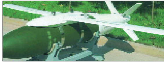
China recently displayed the FT-1 and FT-2 electro-optically guided bombs. The LS-6 glidebomb (right) which resembles Australia's JDAM-ER, is in flight test.

Growth in the PLA's Flanker fleet continues. Two notable developments have occurred. The first was the announcement of the 'indigenous' J-11B built with Chinese components replacing a large fraction of the Russian hardware used in the design. The other notable development was the announcement that the second 100 in the contracted licence build of 200 Su-27SK/J-11A would be built in the Su-27SMK configuration. This fighter bomber variant is a single seat model which incorporates the smart munitions capabilities of the Su-30MKK series, making it an equivalent to a single seat F-15E – a configuration Boeing have yet to produce. Chinese Flankers are primarily armed with variants of the Russian Vypel R-27/AA-10 Alamo and R-77/AA-12 Adder BVR missiles, but the advent of the 'AMRAAM-like' indigenous PL-12, which uses seeker and datalink hardware from the R-77 series, expands the capabilities of the fleet.