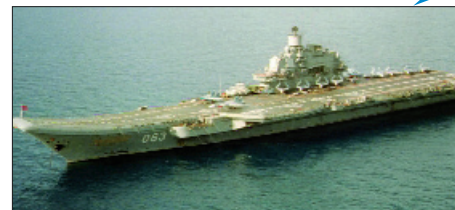
The single seat Su-33 and dual seat Su-33UB are being procured to equip the Varyag carrier air wing. Latest Su-33UB images show the retrofit of thrust vectoring engines.