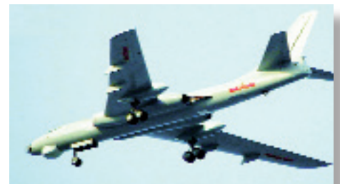
The H-6M is the first of the improved Badger variants to enter operational use. The more recent H-6K with turbofan engines has the performance to reach Northern Australia with a cruise missile payload.

It is almost certain that the Su-33/33UB will be supplemented on the flight deck by variants of the Ka-27/28/29/31 Helix helicopter. With a 15,000 lb class empty weight and 8,800 lb class payload (cf Sea King), variants of the Helix are used for Vertrep / maritime assault / troop transport (Ka-29), SAR (Ka-27PS), ASW (Ka-27/28), over the horizon targeting for ASCMs (Ka-27/28) and AEW&C (Ka-29RLD/Ka-31). The Ka-31 Helix B is also operated by India, and it combines retractable undercarriage with a folding six-metre aperture NIIRT E-801M Oko AEW&C radar with 360 degree coverage.