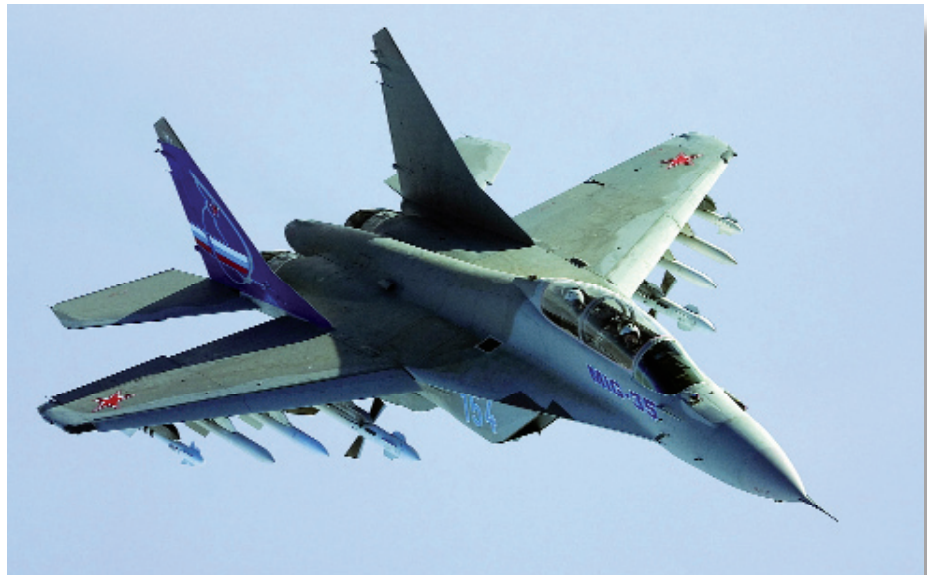
The MiG-35 radar, technologically comparable to the Super Hornet's APG-79 AESA, is a hot favourite in the Indian MRCA contest, and is the first Russian fighter with an active phased array (AESA) radar (top).