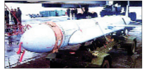
The primary armament of the H-6K will be Tomahawk-like air launched cruise missiles, such as the YJ-62 (left) or Kh-55SM (right).