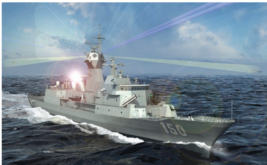
Canberra based CEA Technologies are about to commence sea trials of their X-band active array Anti Ship Missile Defence radar package for the ANZAC frigates. The CEAPAR/CEAMOUNT provides integrated search, track, engagement and CW illumination functions for the ESSM missile. The Australian developed CEA design is in many respects more capable than the US SPY-3 and UE APAR radars, and is specifically designed to overcome the vulnerability of existing shipboard systems to saturation attacks by supersonic sea skimmers such as the Sunburn, Stallion or Sizzler.

The Soviets emulated the maritime strategy of Nazi Germany, and there is good evidence to support this claim. The Kriegsmarine operated a large fleet of U-boats along with fast and heavily armed surface combatants, while the Luftwaffe deployed smart bomb equipped FW-200 Condor and He-177 long range bombers and Ju-88 and Do-217 medium range bombers for maritime interdiction.