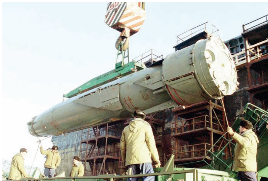
The massive supersonic P-700 Granit / SS-N-19 Shipwreck was the last of the heavyweight Cold War era supersonic ASCMs to enter service. It remains in service on the Oscar II SSGNs and a wide range of surface combatants. It is the immediate ancestor of the current SS-N-26 Yakhont/Brahmos series.

In parallel with the Styx and Shaddock, the Soviets developed a range of new air launched ASCMs to support their growing force of Tu-16 Badger anti-shipping missile carrier aircraft. The first such ASCM, the cumbersome KS-1 Kometa / AS-1 Kennel, was rapidly superseded by the much more