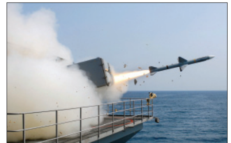
RIM-7 Sea Sparrow.