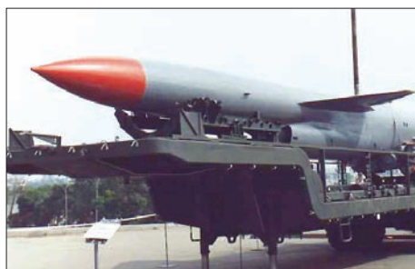
P-500 Bazalt / Sandbox.

The 1980s P-750 Meteorit or SS-N-24 Scorpion/AS-19 was stillborn, an intended Mach 3 replacement for the air launched Kh-22 Kitchen and Shaddock/Sandbox.