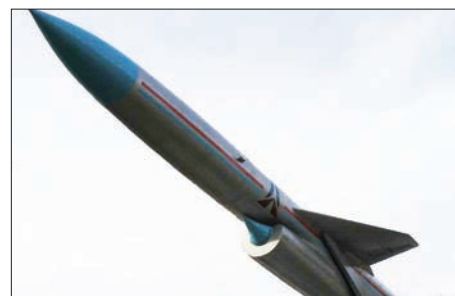
P-1000 Vulkan / Sampson.