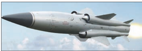
P-270 Moskit / Sunburn.