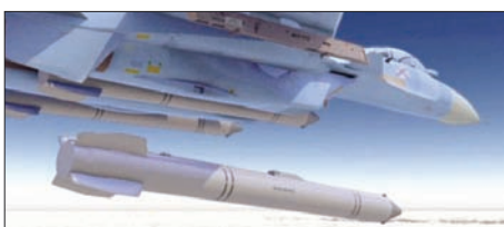
Air Launch supersonic Sizzler.

The Aegis was an essential counter to the Soviet AVMF which could muster around 200 AS-4 firing Backfires and similar number of AS-6 armed Badgers, in addition to the legacy Echo and Juliet SSG/SSGNs, and the newer Papa, Charlie and Oscar SSGNs. An engagement between the Soviet V-MF and US CVBG could have seen hundreds of ASCMs launched in synchronized attacks.