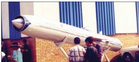
P-800 Yakhont / Stallion.