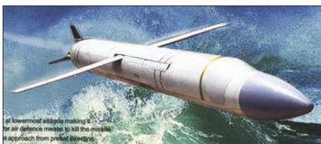
3M54E Klub / supersonic Sizzler.