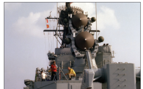
Mechanically steered X-band illuminators to support missile shots have until recently been a common design feature in air defence destroyers and cruisers.