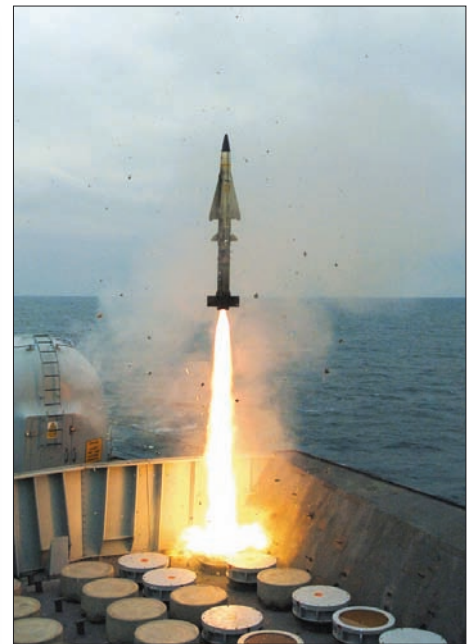
GWS-25 Sea Wolf