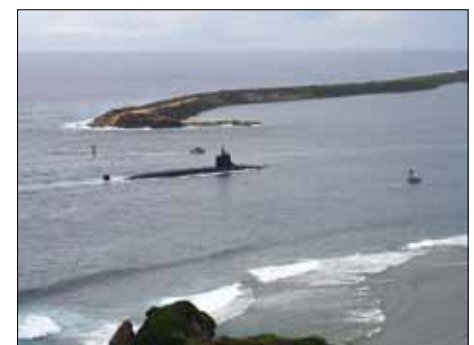
A US Navy SSN entering Apra Harbor, Guam.