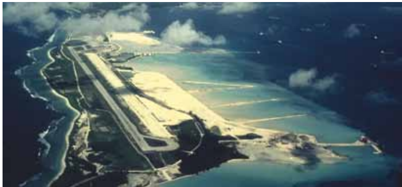
Diego Garcia in the BIOT, the airfield and wharf is shown under construction.