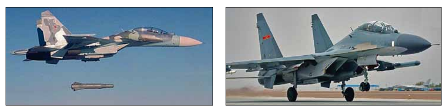
The KTRV/GNPP KAB-1500 with a subcalibre concrete piercing warhead will be available with two different laser seekers, an electro-optical seeker, and satellite guidance. Depicted a test drop and a PLAAF Flanker G, both with the precision electro-optical variant.

What was lost upon many observers was that an air force parked in revetments would have been annihilated with much cheaper munitions in the first two days of the war. Ordinary thin casing 500 lb bombs, cluster bombs and 1,000