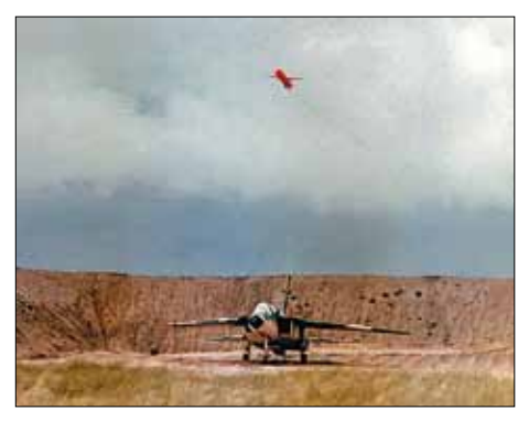
Revetments are irrelevant in the era of PGMs. Global proliferation of weapons such as cruise missiles and smart bombs has fundamentally changed the operational environment.

The effect of PGMs is impressive, as even a basic smart munition has typically ten times the 'kill