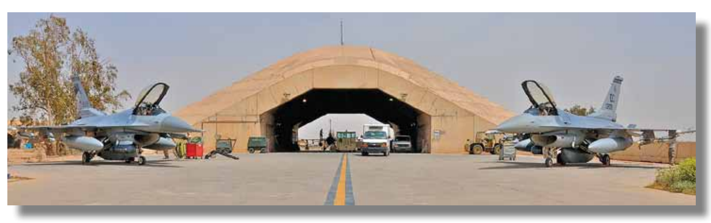
Iraqi Hardened Aircraft Shelter at Balad.

The Information Age could be described as a blessing and a curse, clearly evident in the domain of strategy. Profound changes are underway, as the globalised market for military equipment absorbs a generation of new technologies, including Precision Guided Munitions (PGM), or 'smart weapons' and a plethora of digital Intelligence Surveillance Reconnaissance (ISR) systems. These technologies, developed initially in the West, are now being manufactured by numerous players, most notably Russia and China, and are now available to any nation with the cash, if not under concerted UN embargo.