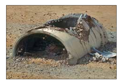
The survivability of Iraqi HAS varied widely. The least robust HAS were destroyed with single rounds, others required multiple hits. Depicted HAS at Al Salem.