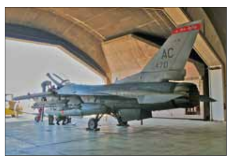
ANG F-16 in a HAS at Balad. Well constructed HAS survived the two air wars and remain in use.