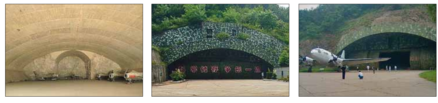
The underground hangar complex at Luyang / Rhange-Zhen is no longer in operational use, and was never completed. It is unusual as it includes tunnels sized for Badger and Beagle bombers. The segmented blast doors were built to resist near miss nuclear attacks. The very recent upgrade of the Hainan Do airbase yielded a similar configuration.

The advent of nuclear weapons brought NATO nations and the Soviets back to hardened structures, primarily to protect ballistic missile launch sites and Launch Control Centres from nuclear armed ballistic missile attack. These were initially designed to protect from overpressure