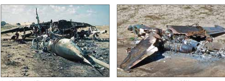
Iraqi Frogfoot and Flogger destroyed on the ground. Unprotected aircraft cannot survive where PGMs are employed.

Saddam's hardened airbases proved ineffective, and Coalition tactical fighters destroyed 375 of 594 during the six week air campaign. With complete control of the air won within the first day, Coalition fighters were able to repeatedly attack HAS installations until they were cracked open. The pivotal weapon used was the American 2,000 Ib BLU-109/B I-2000 Have Void concrete piercing bomb, fitted with either the GBU-10, GBU-24 or GBU-27 laser guidance kit. Typically two weapons were used per target, the intent being for the second round to punch into the hole made by the first round. While many HAS were punctured in an initial attack, many others required repeat attacks until fatal damage was inflicted. This absorbed a significant proportion of available Coalition sorties. as the limited number of F-111, Tornado, and Buccaneer aircraft equipped to laser illuminate targets set hard limits on daily sortie rates.