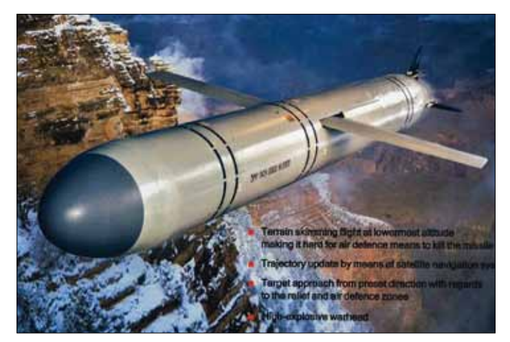
The land attack 3M14E Sizzler variant is a standard weapon for late model Kilo-class SSKs, which are widely used across Asia, and is intended for attacks on airfields. It is highly effective against revetted aircraft.

Infrastructure hardening has some profound implications for the present and future combat engagements. Not only must platforms be stealthier to evade engagements, and hardened to survive enemy fire in engagements, but also basing infrastructure must be more robust.