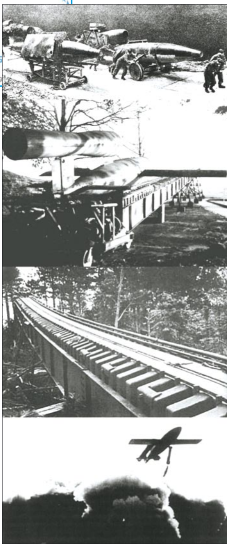
Left - top to bottom: Personnel handing FZG-76 rounds in shipping configuration, with stowed wings; FZG-76 on the ramp launcher, being prepared for a launch; ramp launcher viewed from the missile's position; an FZG-76 clears the end of the launch ramp in a cloud of steam produced by the hydrogen peroxide powered rocket catapult.