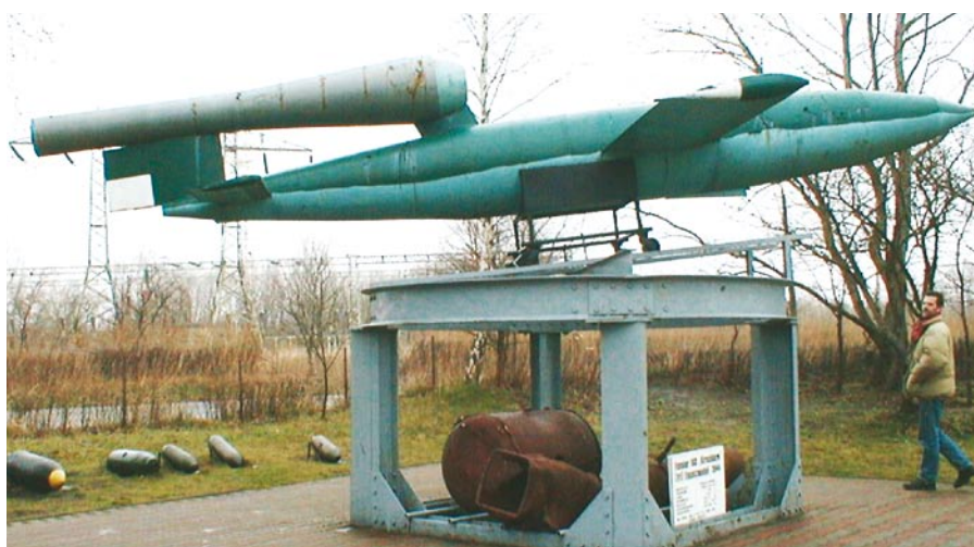
Fieseler FZG-76/V-1 on display in Germany. It was the first operational cruise missile and defined the "disproportionate response" strategy in use to this very day.

The enabling technology for FZG-76/V-1 was the Schmidt pulse jet patented around 1930. This simplistic design used a combustion chamber with a long tailpipe and an inlet face covered with an array of spring loaded air inlet valves. Once started, the valves cycled open and shut 40-50 times per second – when open drawing air into the combustor, closing as the pressure equalised, upon which a spark would ignite the fuel air mixture, generating a pulse of thrust. As the pressure wave