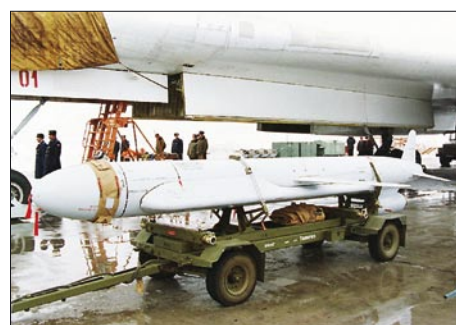
Modern cruise missiles like the US BGM-109G GLCM (upper) and Soviet Kh-55SM Granat (lower) produce much the same strategic effect as the FZG-76 did in 1944 – they force a “disproportionate response” in the deployment of air defence assets to stop them.