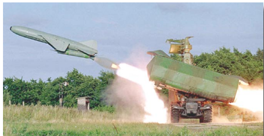
A key innovation introduced by the Soviets during the 1950s was the use of the high mobility 8 x 8 MAZ-543 as a TEL for ground launched cruise missiles, such as this 4K51 Rubezh system armed with the P-15 Styx antishipping missile.