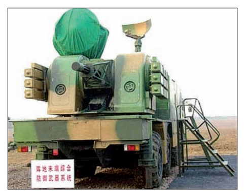
The Chinese LD-2000 SPAAGM, base on the Dutch 30 mm Goalkeeper, has considerable but yet to be fully developed potential as a C-RAM/C-PGM system. The LD-2000 has been integrated with a cloned Chinese TPQ-36 Counter Battery Radar.

The flipside of this evolutionary process is the declining cost and increasing capability of PGMs, especially Western weapons which are being made smaller, smarter and more lethal, to permit single delivery systems to attack more aimpoints in a single delivery. Good examples are artillery rockets or cluster bombs dispensing multiple smart terminally guided submunitions, or fighter aircraft dropping eight GBU-39/B Small Diameter Bombs