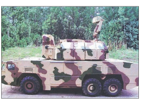
Russian 9A331MK Tor M2E C-PGM SAM system.

Western C-RAM systems will have to evolve capabilities to kill incoming PGMs. In part this reflects the reality that PGMs are no longer a weapons technology exclusive to Western nations, as Russia and China have exported and increasingly so will export a diverse range of PGMs into a globalised market. These range from land attack optimised air/sea/sub/land launched cruise missiles at the top end, through guided bombs,