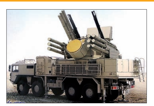
Russian 96K6 Pantsyr S-1E C-PGM SPAAGM system.

US$5000, whereas if the PGM is a top-end cruise missile, it would still be viable at a cost-per-shot of US$1,000,000.