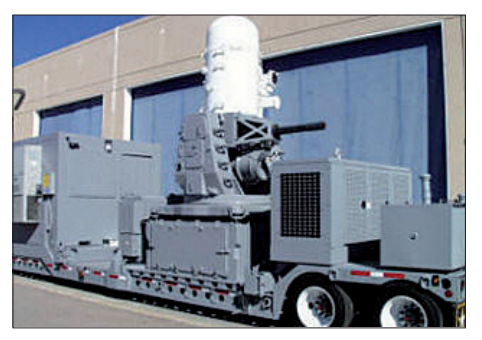
The US Army's new C-RAM Phalanx combines the existing naval CIWS system with existing CBR radar.