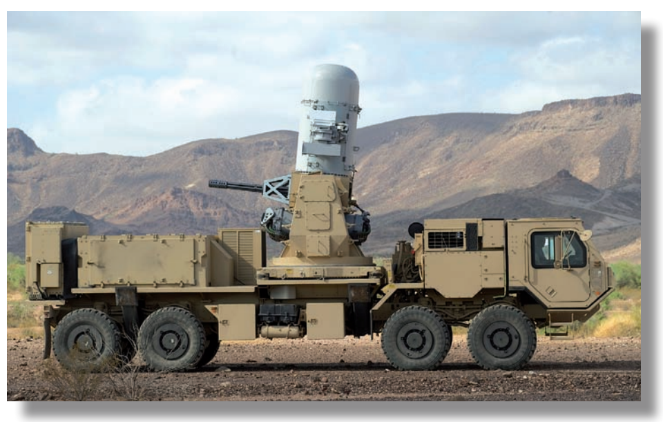
C-RAM Phalanx is a land based derivative of the naval CIWS.

While Western thinking in this area is driven mostly by the imperative of protecting military and civilian personnel and facilities from often primitive unguided weapons, a parallel evolution is