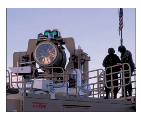
THEL Deuterium Fluoride laser demonstrator beam director.

frustrate tracking by low altitude terrain following but certainly designed to impact the target with an optimal trajectory and impact angle. The target's signature is apt to be intentionally low, especially in the X- and Ku-bands used for engagement radars. Whether Western or Russian doctrine is followed, the weapon is apt to be used in concurrent multiple round salvoes, so a C-PGM system will be presented with multiple concurrent targets, but also with very short times to acquire, track and engage, denying time for reattack if an initial shot fails to kill. PGMs, especially missiles, typically being much larger than artillery and mortar rounds and comparable to Katyusha rockets in size will be easier to inflict damage upon.