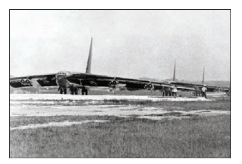
Parking and managing the flow of B-52s operating from Andersen AFB presented major issues during the intensive bombing campaigns of the Vietnam conflict. These Buffs are about to sortie during Linebacker.