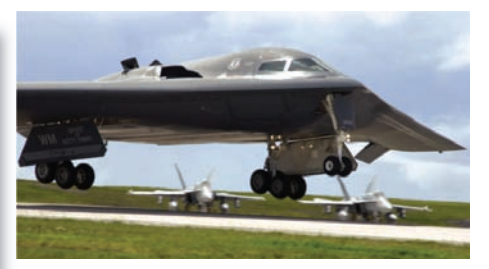
The B-2A is now a regular visitor at Andersen AFB. To support such deployments, a transportable hangar was designed, permitting field maintenance of stealth materials.