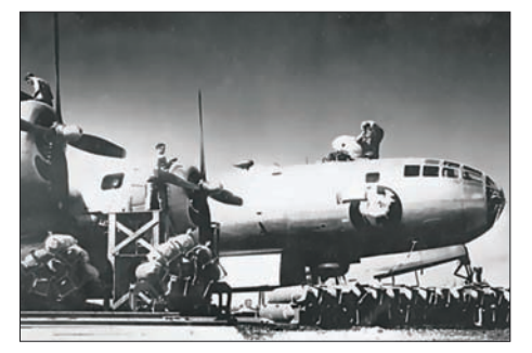
A B-29 of the 330th BG, 314th BW, undergoing maintenance at North Field, Guam, in 1945. Gen Curtis LeMay's B-29s burned down most major cities in Japan, as well as destroying more coastal shipping than Navy submarines did by mining shipping lanes.

The US Air Force presence is concentrated at Andersen AFB, home base to the base support 36th Wing, and now hosts a permanent deployment of heavy bombers, rotated through the base from US