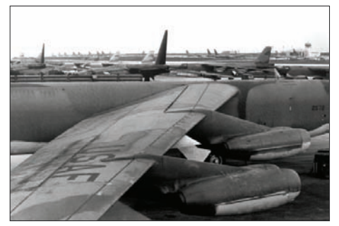
The Vietnam conflict saw Guam heavily used as a base for B-52s conducting Arc Light raids in the South, and later the Linebacker II raids against the North. Up to 153 B-52s were flown at any time from Andersen AFB.