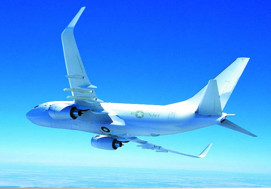
Boeing's MMA proposal is based on the 737-800 airframe, with a heavier -900 series wing. The fuselage is extensively modified to accommodate a sonobuoy bay and internal weapon bay. Pylons are used for the external carriage of weapons such as the Harpoon missile.

The world of Long Range Maritime Patrol is undergoing the biggest technological and operational changes seen since its inception during the 1940s. These changes are a reflection of evolving roles and missions, and growth in a range of new technologies, especially long endurance UAVs and ISR sensors. Over the next two decades we can expect to see the evolution of a quite different paradigm to that we have known for six decades.