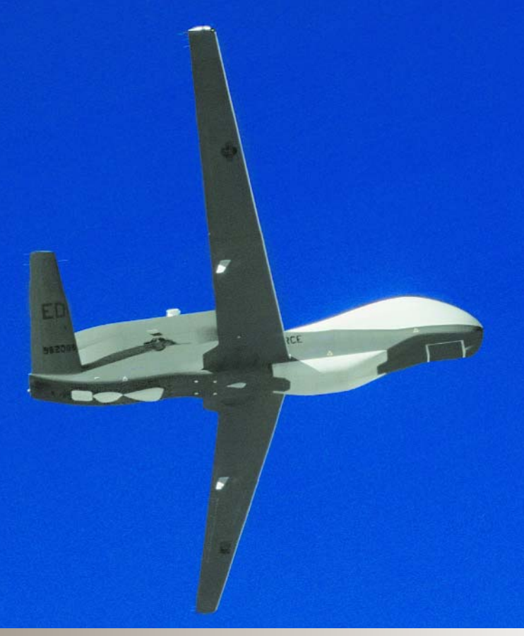
We have yet to see the full impact of HALE UAVs such as the RQ-4 Global Hawk on the maritime patrol roles and missions environment. With superior footprint coverage and persistence, UAVs offer some attractive capabilities absent in 'classical' manned patrol aircraft.

slow and clumsy Catalinas soon supplanted by the PB4Y-1, a rebadged B-24D/J, and later its offspring the single tail PB4Y-2 Privateer.