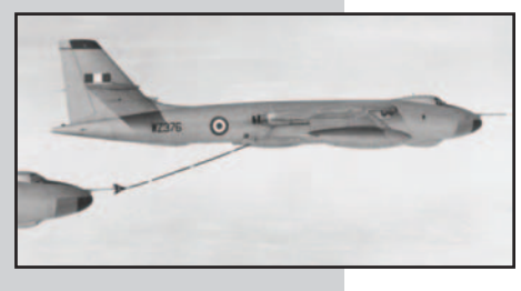
The Badger is a very close equivalent to the long retired RAF Vickers Valiant B(K).1