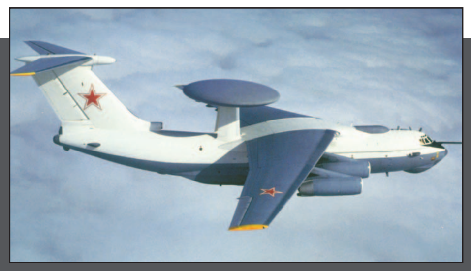
Beriev A-50E AWACS (Beriev)

The collapse of China's plan to acquire the Beriev A-50I AEW&C with the Israeli Elta Phalcon phased array radar was a significant setback for the PLA-AF, and was a loss of face globally to the US. The Chinese leadership vowed publicly they would get an AEW&C capability.