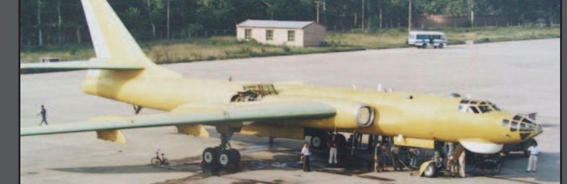
New production PLA-AF H-6M cruise missile carrier. The follow-on H-6K has a turbofan engine.

The II-78 is a conversion of the II-76 Candid airlifter airframe, conceptually not unlike the USMC KC-130 tankers. Around 80,000 lb of auxiliary fuel is carried in two large fuselage tanks, mounted on fixed pallets carried on the main freight deck. While the earliest Midas tankers were reported to be dual role 'convertibles', indications are that more recently built aircraft are dedicated tankers, with a single large fuselage tank for auxiliary fuel.