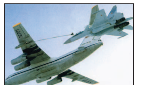
Russian II-78 Midas gassing an Su-35.

Indian II-78MKI gassing two Su-30MKIs (IAF)