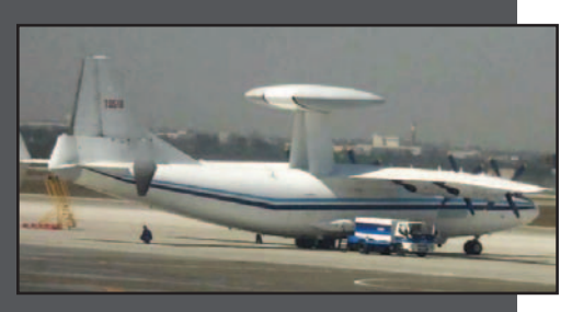
The Y-8 AEW&C prototype using a conventional radar and rotodome