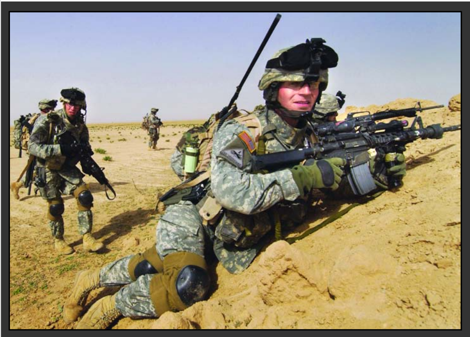
To fight the long war in Iraq, Afghanistan and against terrorist forces around the world the US Army will be converted from a divisional structure to modular brigades, with 42 Brigade Combat Teams (BCT) and 75 supporting brigades in the active army, 28 BCTs and 136 support brigades in the National Guard and Reserve.

THE FINAL MAJOR AREA IN THE QDR FOCUS IS 'Preventing the Acquisition or Use of WMD'. This addresses not only rogue states such as Iran and North Korea, but also nations with WMD inventories that face instability and internal problems. While the strategy outlines both 'preventive' and 'responsive' dimensions to the problem, significant investments will be made into capabilities for the