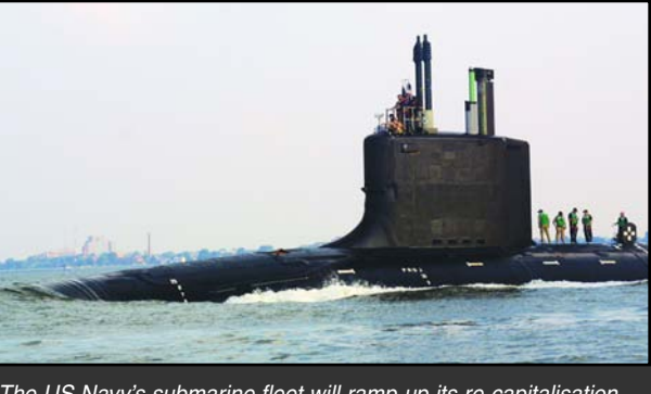
The US Navy's submarine fleet will ramp-up its re-capitalisation with the new Virginia-class to be delivered at an increase rate of two per year by 2012. The new Virginias, with increased optimisation for littoral warfare, will join the two Ohio-class ballistic missile submarines converted to launching platforms for special forces and Tomahawk land attack missiles. (Journalist 2nd Class Christina M. Shaw, US Navy)