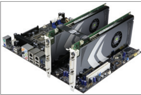
NVIDIA's 8800GT GPU is a good example of the state of the art in low cost rendering technology, intended to produce lifelike imagery.

with all three colour channels. The drawback of such projector CRTs was in limited life, due to the exhaustion of phosphors and cathodes – a more severe manifestation of CRT exhaustion seen in consumer displays.