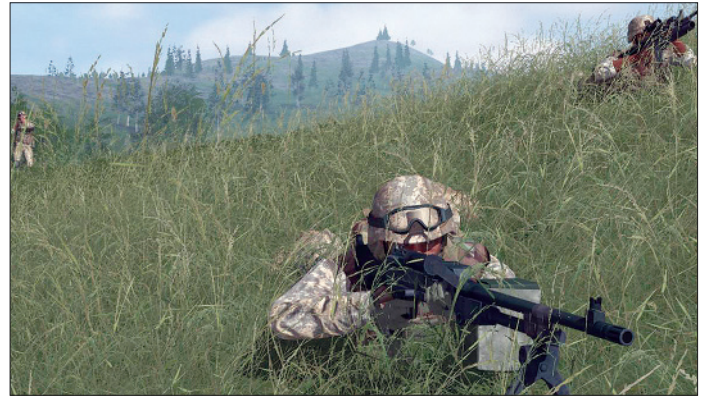
A good example of the expanding use of simulators for roles other than platform crew training is the Bohemia Interactive VBS2 simulator, used by the USMC for training.

At the top end, the flight simulator market involves a six-axis motion system moving a lifelike (internally) mockup of a crew station or cockpit, elaborate high resolution and very fast graphics rendering and expensive display technology, even providing collimated presentation (focused at infinity) and covering often as large a visual field of view as can be observed by the crew. Air combat simulators often use hemispherical domes to permit the crew to observe the environment within the full field of view of a bubble canopy. In this respect, flight simulators are the most technologically challenging to build, compared to land and naval warfare platforms.