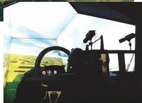
Top end simulation products use expensive display technologies, including collimated displays, dome displays, and rear projection displays, to create the illusion of reality. Depicted are CAE simulators used for aircrew training.

generates the imagery for a display device. The video signal output from the graphics engine is then fed to one or more display devices. The latter may vary between projectors at one end of the spectrum, to plasma or LCD panels at the other. If a simulator is merely presenting a radar or sonar