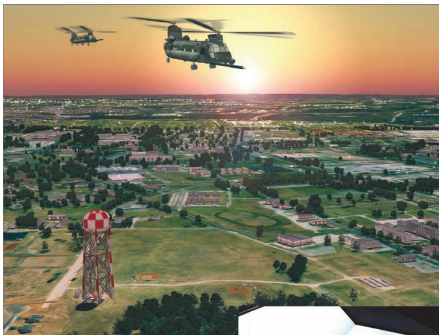
High fidelity scene imagery produced by a CAE graphics engine.

This software will generate rendering commands for a graphics engine, the device that actually