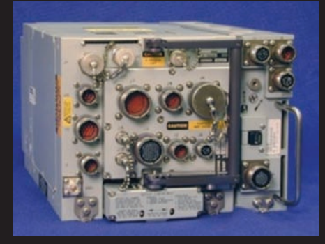
The ROBE system integrates two existing communications equipments, the MIDS-LVT terminal and the AN/ARC-210 UHF radio (Rockwell Collins).