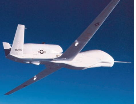
High-flying UAVs make for excellent communications relay platforms, with a better footprint than a Smart Tanker due to station altitudes of 60,000 ft or better. The drawback is that a large payload may force the commitment of a whole UAV with all of its operating costs. DARPA and the US Air Force initiated the development of the ABN payload for the Global Hawk some years ago, but the absence of recent reports suggests this program is no longer funded.

The US Air Force and DARPA did recognise this and when the RQ-4A Global Hawk High Altitude Long Endurance UAV program was launched, (ACN), which effectively launched the first military pseudolite program.